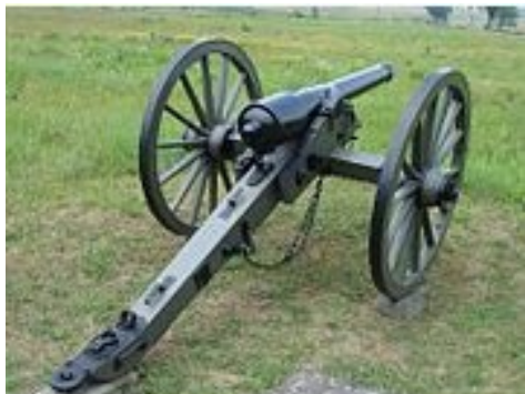
10-Pounder Parrott Rifle