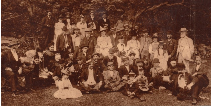
Independent battalion, First Massachusetts Cavalry, Civil War Veterans pictured having a picnic at Fort Phoenix in Fairhaven, August 24, 1892.