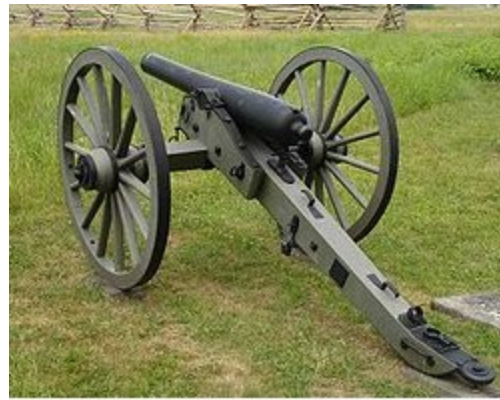
3-Inch Ordnance Rifle (rear view)