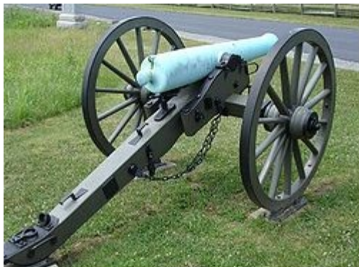
M1857 12-Pounder "Napoleon"