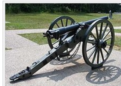
12-Pounder Whitworth Breechloading Rifle.