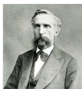
Chamberlain as the Governor of Maine.

Join us Tuesday, September 27th, to hear this fascinating story. Please consider bringing a guest. We begin the meeting at 7:00 pm, at the Fort Taber~Fort Rodman Military Museum—the building opposite the tank, after you have entered the park. There is no charge for the lecture. The meeting is open to the public.