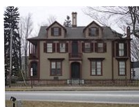
The Joshua Chamberlain Museum