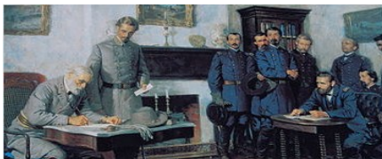
A painting of Ulysses S. Grant accepting Robert E. Lee's surrender at the McLean House in 1865.

...Hearing through General Sheridan that Lee might surrender if pressed, Lincoln tells Grant, “Let the thing be pressed”