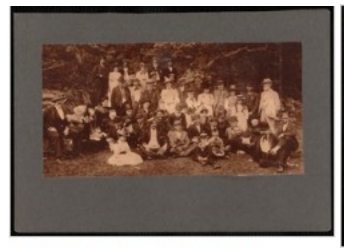
Independent battalion, First Massachusetts Cavalry, Civil War veterans reunion at Fort Phoenix in Fairhaven